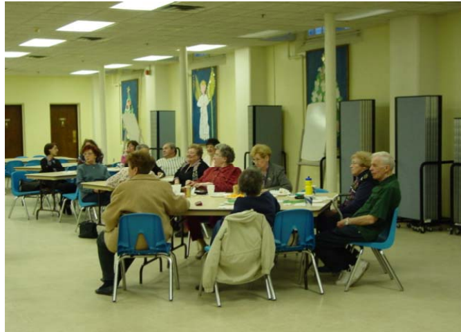
Players await the announcement of the winning horse