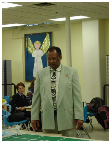
Deputy Grand Knight assists in the calling of a race